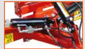
Two hydraulic cylinders with ball valves