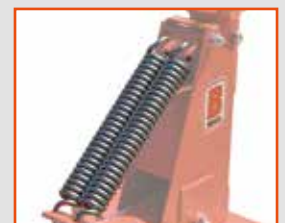
Springs adjust the pressure of the wheels to the ground