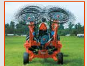
Narrow 8" transport width