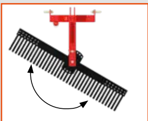
Up to 32° angling on standard duty rakes