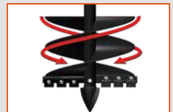
Heavy duty double flighting on all augers