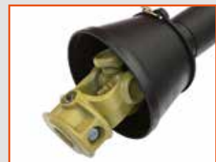
Driveline with shear pin safety