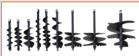
Choice of 6, 9, 12, 18, 24 and 30" auger diameters and 36" or 48" auger lengths

** Available only for models 300-512 & 400-512.