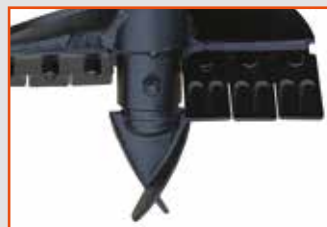
Replaceable knives and points