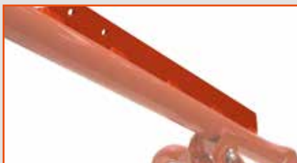
Reinforced frame and three point hitch on model 300-512 & 400-512