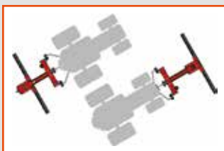
Front or rear tractor mounting