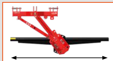
Up to 21" offset