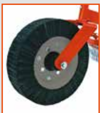
Laminated tail wheel