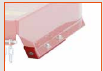
Replaceable side skids