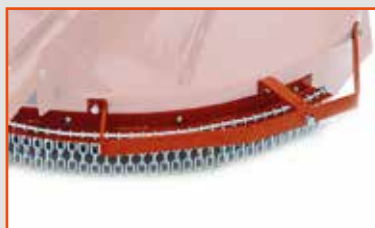
Safety chains & shields