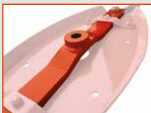
Carbon steel rotor with free swinging blades