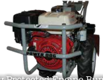
Fully Protected Engine Bumper