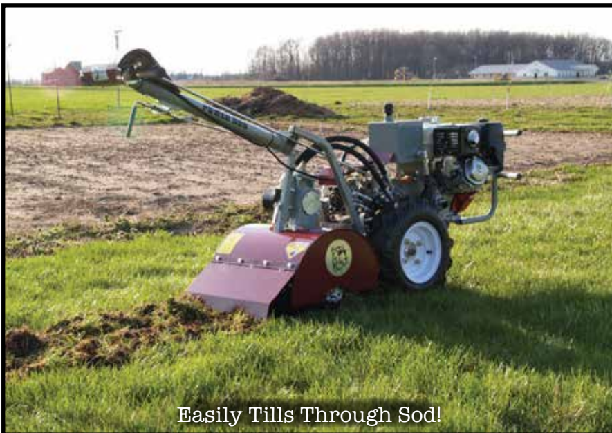
Easily Tills Through Sod!