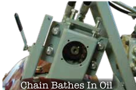
Chain Bathes In Oil