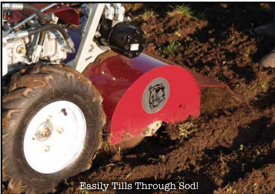
Easily Tills Through Sod!