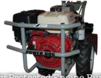
Fully Protected Engine Bumper