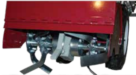
Heavy Double Sided Tines!