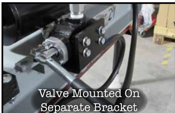
Valve Mounted On Separate Bracket