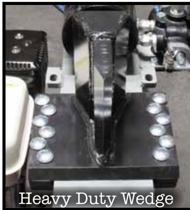
Heavy Duty Wedge