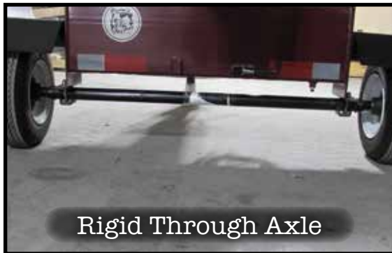
Rigid Through Axle